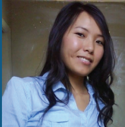
Del Norte Clinics, Inc.—Chico

Increased patient access is made possible at Del Norte Clinics, Inc. through our Telemedicine (TM) Program. Bringing specialty care closer to rural patients is the central purpose of Telemedicine, in which clients are seen and evaluated by a specialist (i.e. psychiatrist, dermatologist, endocrinologist, neurologist, etc...) via a broadband connected television or computer system. Our program utilizes specialty services offered by the University of California system made available by a federally subsidized, state-wide collaborative. The benefits of Telemedicine go beyond medical consultations; it is a venue for provider and specialist collaboration, education of clinical staff, and decreasing patients' travel time costs.