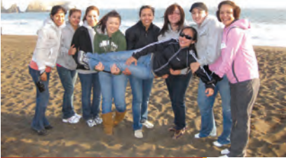
CVHN AmeriCorps Members at the 2009 California Health Corps Retreat in Sausalito.

"I connected with my community and formed relationships with organizations who can further our objective of reaching and assisting our low-income population."